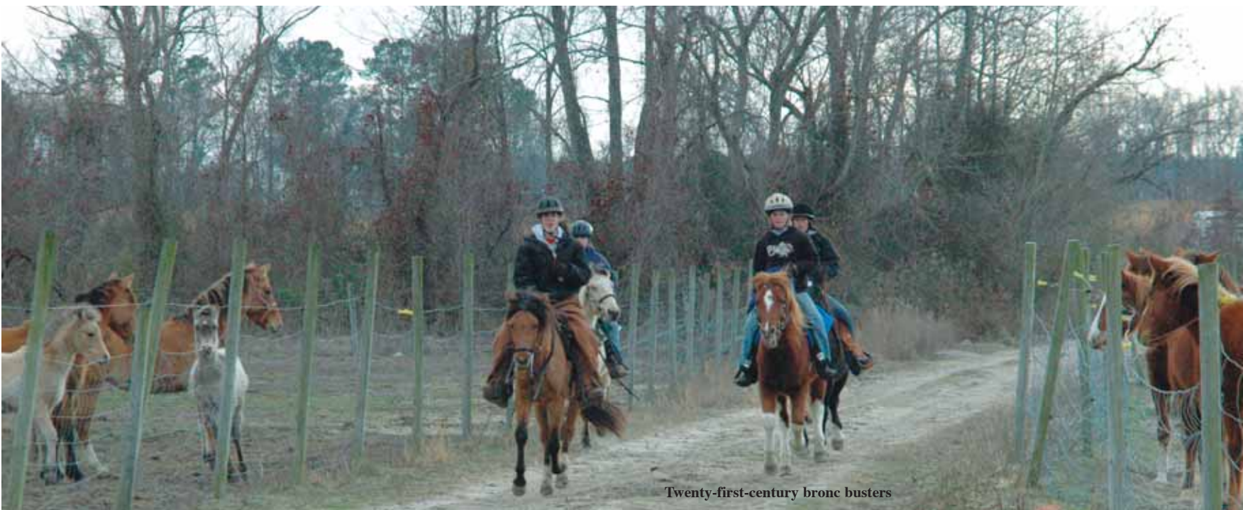
Twenty-first-century bronc busters