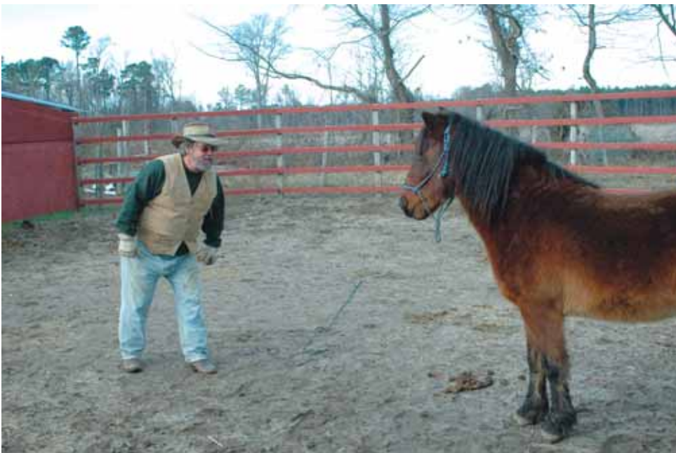
The author helps Red Feather, a wild Corolla mustang, learn to accept human presence.

methods in several states, from Delaware to North Carolina. In November 2006, we produced a commercial DVD to give step-by-step instruction in the gentle and humane method of training used at Mill Swamp. Many of the riders have purchased colts bred at Mill Swamp and have