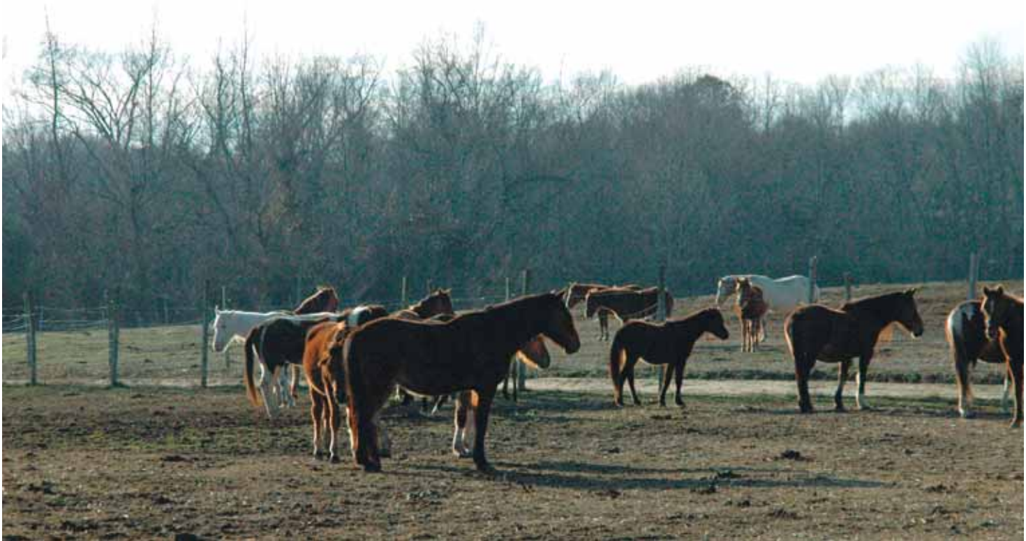
Some of the ponies were captured in the Nevada deserts and others on the beaches of the Outer Banks, but all have found a home at Mill Swamp Indian Horses.